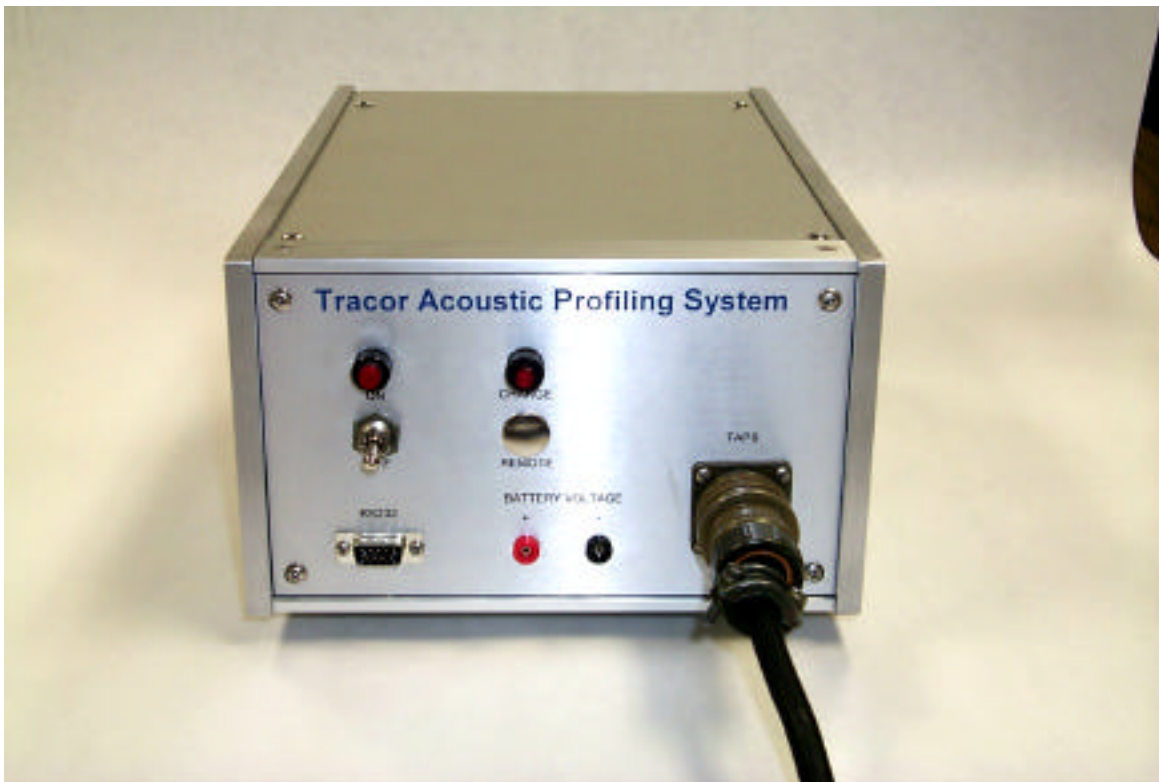
Figure 4. TAPS charger/IO unit. A TAPS interconnect cable is attached. A DB-9 connector (lower left on front panel) is supplied for connection to the serial port of a host computer. Charging voltage may be measured on the front panel test jacks. AC power and charge state are indicated on the panel lights.

transceiver power is first applied. Power from the CHARGER/IO unit supplies all of the average power needs of TAPS and trickle-charges the battery.