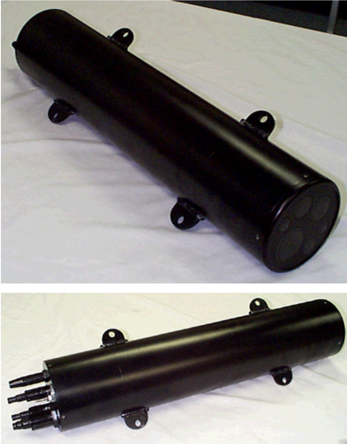
Figure 1. TAPS external views. The six acoustic transducers are the circles on the endcap visible in the top picture. Each channel uses a separate transducer. The connectors for I/O, power switching, and external sensors are visible in the lower picture, as is the thermistor. The depth sensor is on this endcap as well.